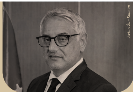
Avtor: Žan Kolman

I believe successful cooperation is possible in many fields, such as the automotive industry, e-mobility, aero and defense industry, medical care equipment, chemical, pharmaceutical in-